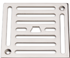
Polished stainless-steel finish