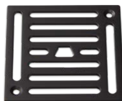
Matte black finish