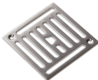
Brushed nickel finish