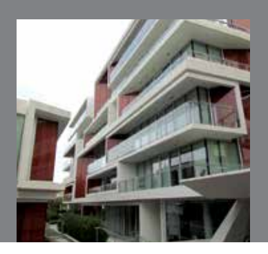
Aperture Living Development Vancouver, British Columbia Elastocolor Flex

To experience the MAPEI difference and discuss possible solutions for your property, please contact us at 1-800-42-MAPEI for details of the MAPEI representative in your area.