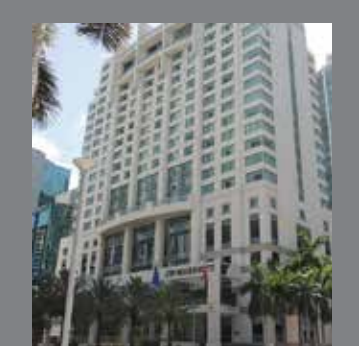
JW Marriott Miami Downtown Miami, Florida Mapefer™ 1K, Planitop® 12 SR, Elastocolor Primer WB, Elastocolor Flex Fine, Elastocolor Coat Smooth