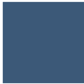
Dark Blue | TNS 16