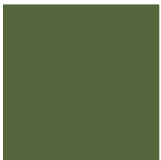
New York Green