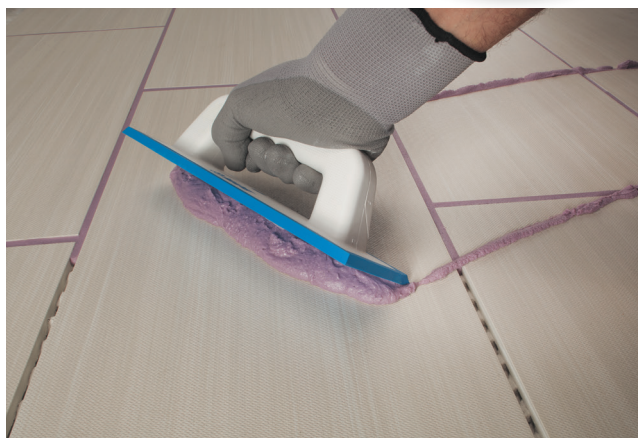
Applying Kerapoxy CQ with a Mapei trowel