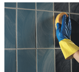
Removing liquid residues with a rubber spreader