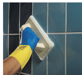
Cleaning with water and a disk cleaner fitted with a "Scotch Brite®" type abrasive disk