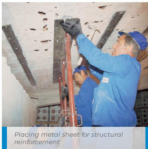
Placing metal sheet for structural reinforcement