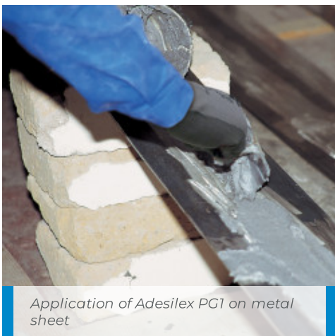
Application of Adesilex PG1 on metal sheet