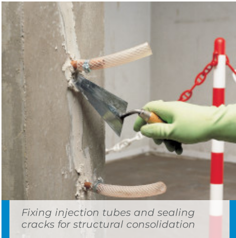
Fixing injection tubes and sealing cracks for structural consolidation

Adesilex PG1 and Adesilex PG2 must be applied within the useful pot life time. It is therefore necessary to plan the work within the time limit mentioned above.