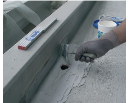
Final covering with Adesilex PG4