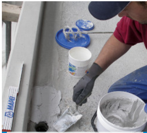
Applying Adesilex PG4 with a trowel