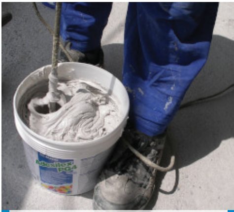
Preparing the mix