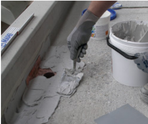
Subsequent smoothing with Adesilex PG4