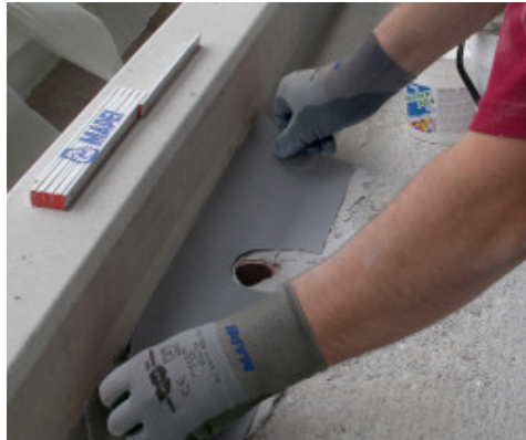
Laying flexible hyphalon brace