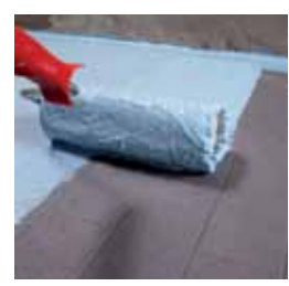
1° coat on existing tiles