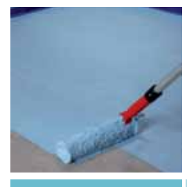
1° coat on screed