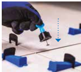
Inserted from above