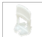
MapeLevel ProWDG Spacer C-H White spacers in 4 thicknesses according to the width of the grout joint: 1, 2, 3 and 5 mm. For tiles 12 to 20 mm thick