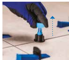
Removable and reusable