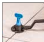
Adjustment tool included with every pack of MapeLevel Easy T