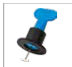
Levelling element MapeLevel Easy T