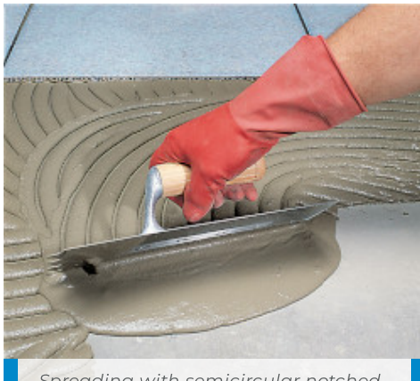
Spreading with semicircular notched trowel