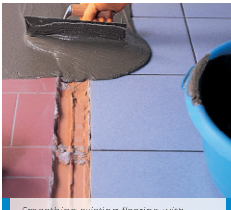
Smoothing existing flooring with Adesilex P4