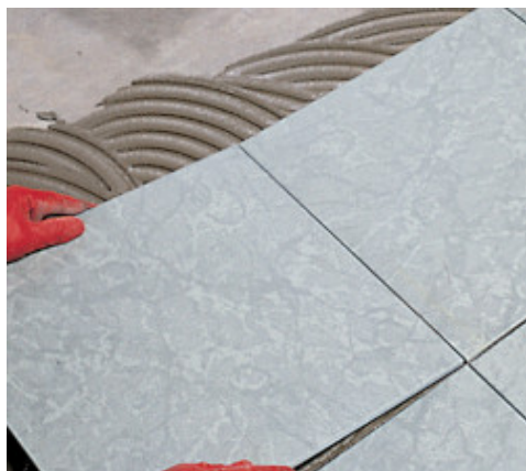
Laying porcelain tiles