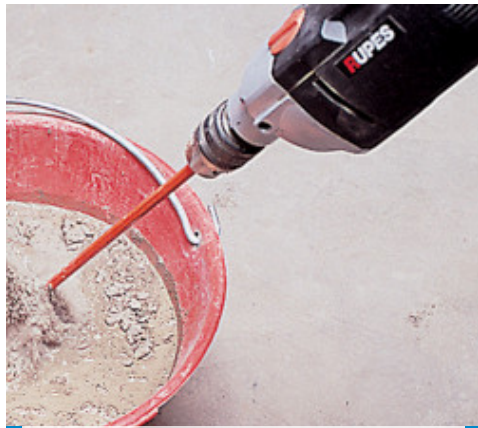
Mixing Adesilex P4

Tiles set with Adesilex P4 must not be subject to washout or rain for 3 hours at a temperature of +23°C and must be protected from frost and hot sun for at least 24 hours after installing.