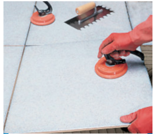
Laying large size tiles