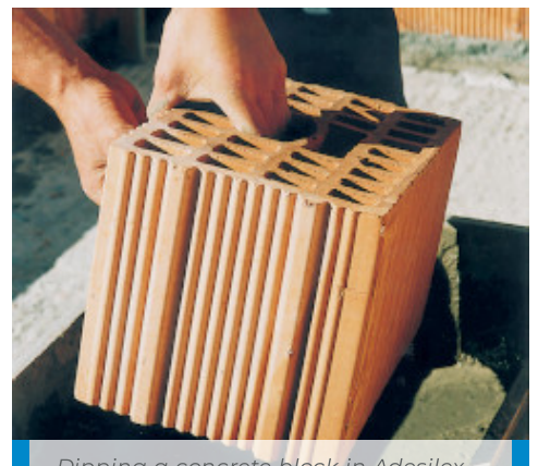
Dipping a concrete block in Adesilex P4