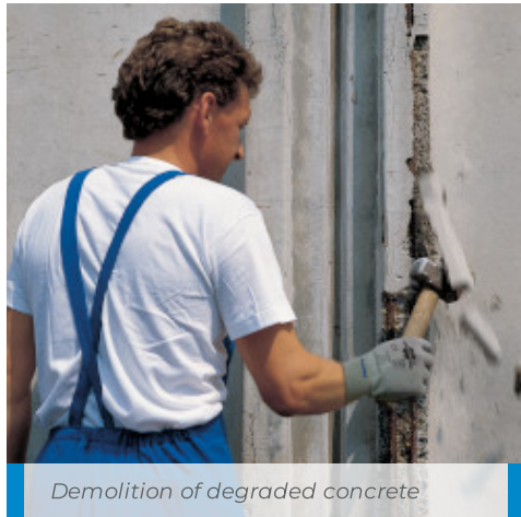
Demolition of degraded concrete

The application of the repair mortar (e.g. products of the Mapegrout line) that follows, can be carried out on cured Mapefer after approximately 6 hours at +20°C.