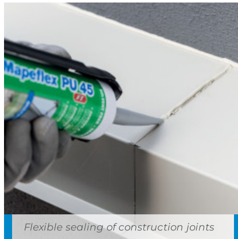
Flexible sealing of construction joints