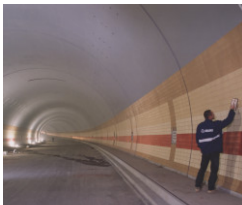
Mrázovka Tunnel - Prague - Czech Republic

N.B. The technical data of Kerabond T mixed with Isolastic are on the latter's technical data sheet.