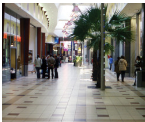
Kingcross Shopping Centre - Zagabria - Croatia