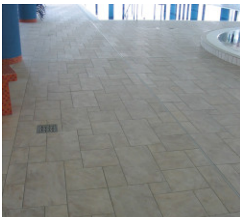
Hotel Radison - Bükkfüdő - Hungary