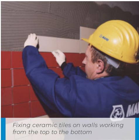
Fixing ceramic tiles on walls working from the top to the bottom