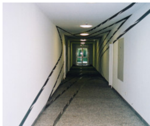
Alliance insurance offices - Munich - Germany