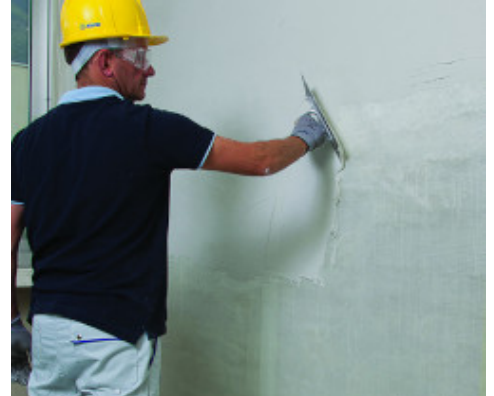
Skimming the surface with PLANITOP 200