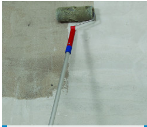
Application of the first layer of MAPEWRAP EQ ADHESIVE