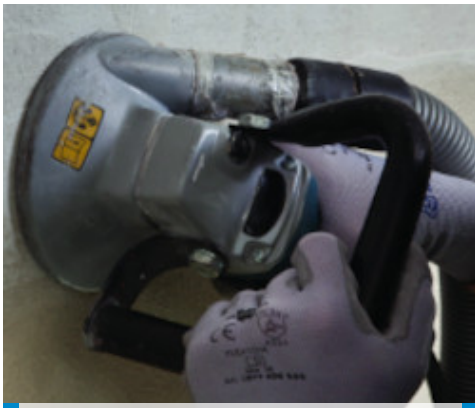
Removal of old paint from the substrate