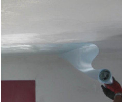
Application of MAPEWRAP EQ NET reinforcement fabric on ceilings