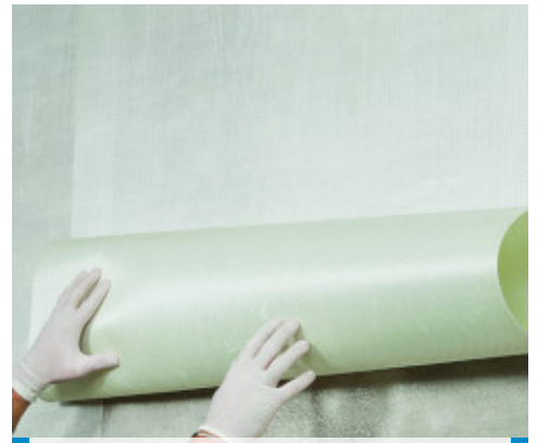
Application of MAPEWRAP EQ NET reinforcement fabric on walls