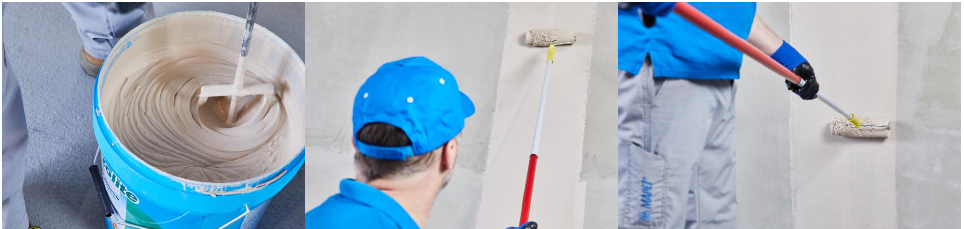
Figure 1: product images

For more information see the TDS (Technical Data Sheet) on Mapei SpA website ( www.mapei.com ).