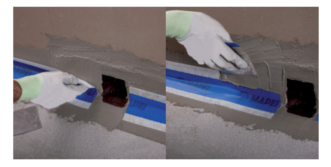
9. Spread a second layer of the specified MAPEI waterproofing product to completely cover the edges of the tape so they are sandwiched between the two layers of the cementitious mortar.