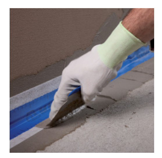
10. Apply a new layer of render on the parapet, or repair the old render removed before carrying out installation in the case of old structures.