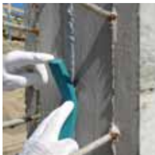
Applying Idrostop Soft on vertical surfaces