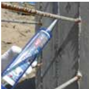
Extruding Mapeflex MS45