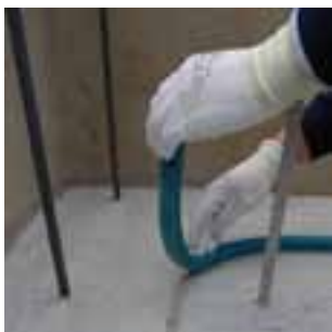
Applying Idrostop Soft on horizontal surfaces