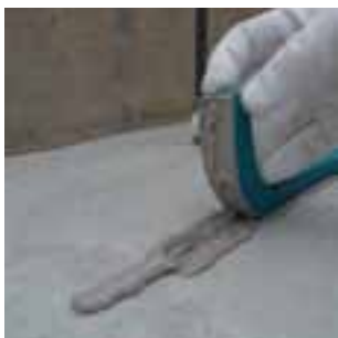
Idrostop Soft's exceptional adherence and stability with the substrate