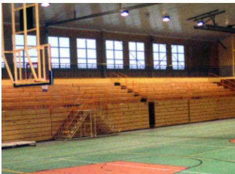
Example of Primer G applied before laying PVC and linoleum in a public gymnasium - Gdansk Orunia Indoor Gymnasium - Poland