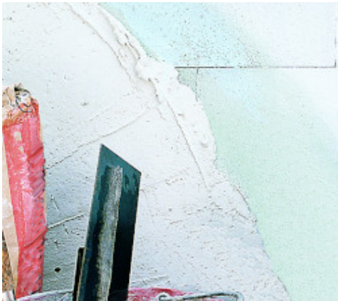
Use as a primer for gypsum plasters