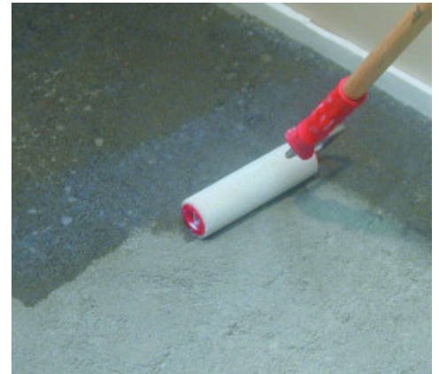
Applying Primer G with a roller