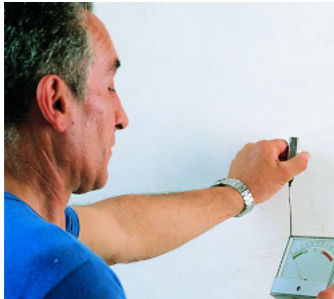
Checking gypsum plaster humidity