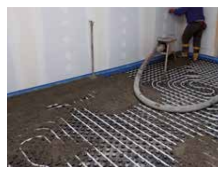
Heated screed made from Topcem Pronto