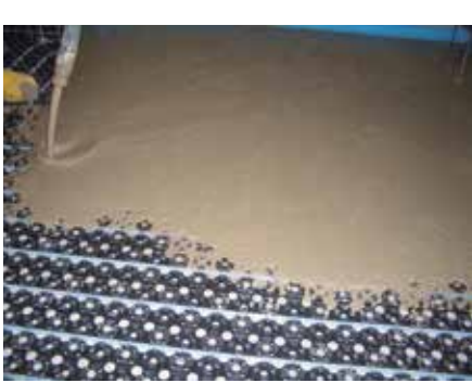
Applying Novoplan Maxi to create a thin heated floor