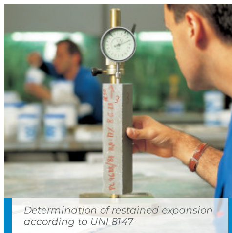
Determination of retained expansion according to UNI 8147