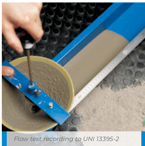
Flow test recording to UNI 13395-2