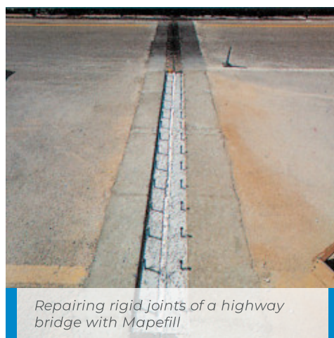
Repairing rigid joints of a highway bridge with Mapefill