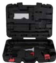
MAPEI GUN 310 ELECTRIC