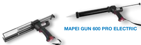
MAPEI GUN 600 PRO ELECTRIC