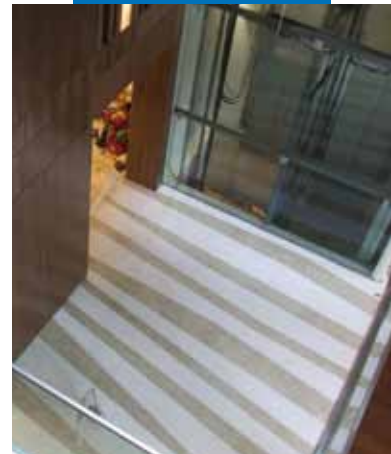
Hotel Design - Budapest - Hungary. "Terrazzo alla veneziana" effect Ultratop