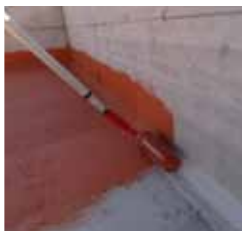
Applying the membrane