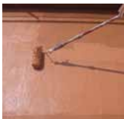
Applying the membrane