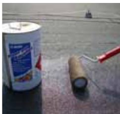
Applying the primer