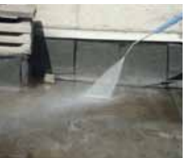
Cleaning the substrate