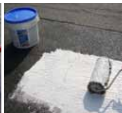
Applying the membrane