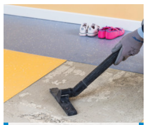
Removing dust with a vacuum cleaner