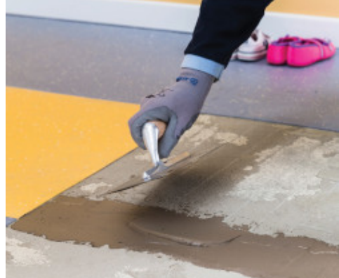
Reintegrating a portion of the substrate