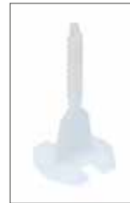
Spacer MapeLevel Easy Spacer L A complete range of screw spacers, available in 3 versions (linear, T and X spacers) and 5 different sizes (1, 1.5, 2, 3, 5 mm).