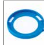
Anti-scratch shield MapeLevel Easy Shield Optional accessory: to be applied under the cap to protect the surface of delicate tiles.