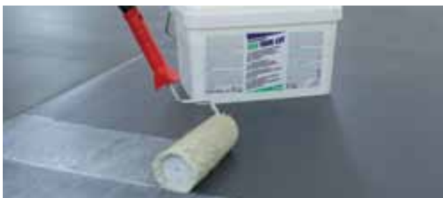
Applying the adhesive Ultrabond Eco Tack LVT