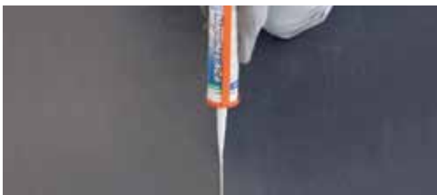
Sealing the PVC sheets with the sealant Mapeflex AC4