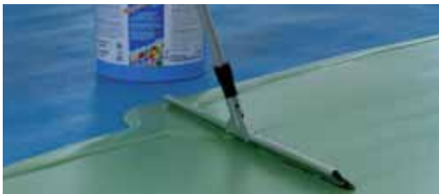
Applying the acrylic coloured coating Mapecoat TNS Finish