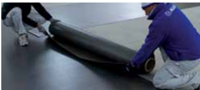
Rolling out the fibre-reinforced PVC mat