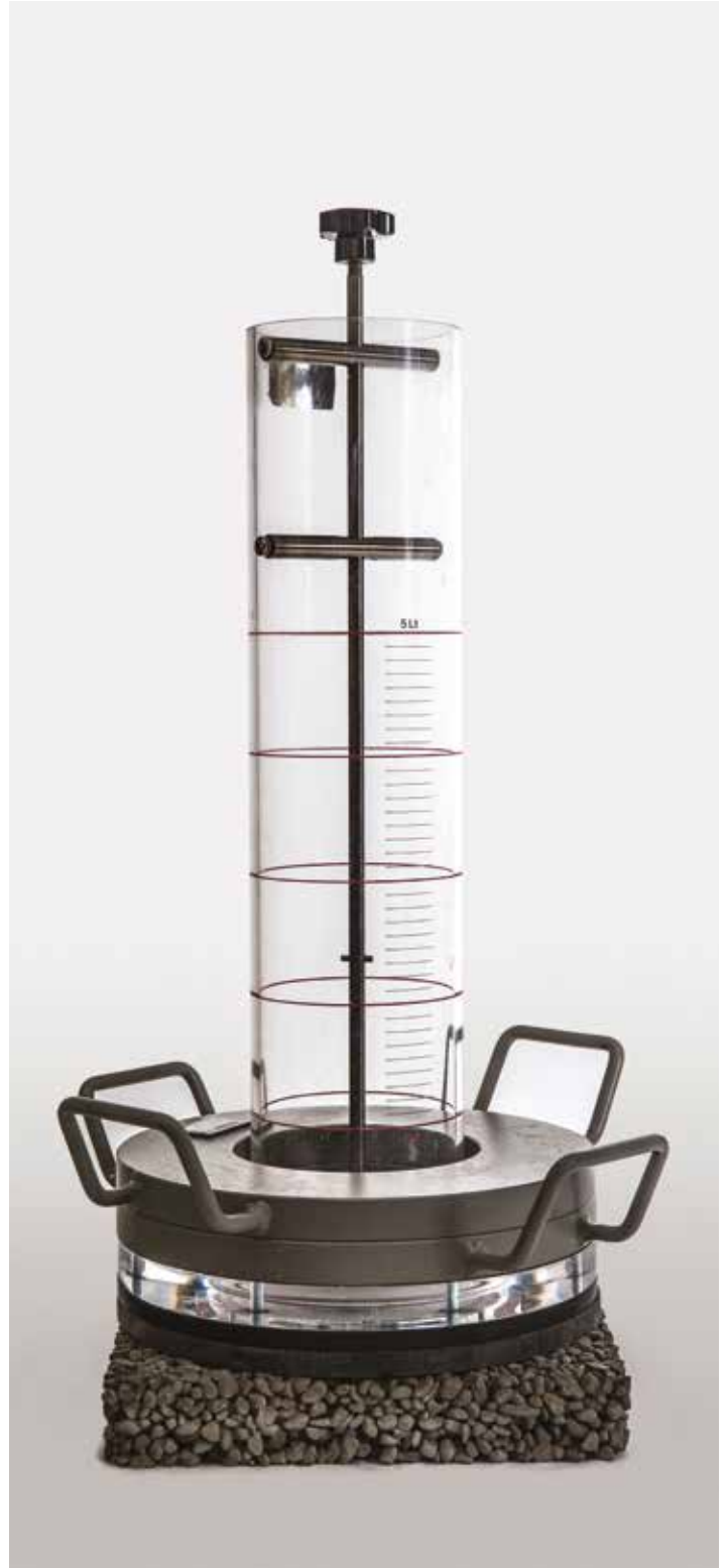
Permeameter for asphalt (EN 12697-40)

▼ The main property of pervious concrete is its hydraulic conductivity, that is, its capacity to drain off a certain amount of water from a surface. This property is closely connected to the void content, which is generally between 15% and 30%, and is known as its effective porosity. This figure is defined as the ratio between the volume of water released by gravity from a sample of perfectly saturated pervious material and the total volume of the sample. Hydraulic conductivity, therefore, depends on the effective porosity which, in turn, depends on the size of the voids and, above all, the channel system and the way they inter-communicate. The higher the amount of voids, the higher the drainage capacity of the concrete, to the detriment, however, of its mechanical properties, which are influenced by a more open structure. Conversely, a lower amount of voids will reduce the drainage capacity but gives concrete better mechanical properties. The hydraulic conductivity of pervious concrete is normally measured in situ with a permeameter for asphalt, calculating the time required to empty a column of water from a graduated cylinder.