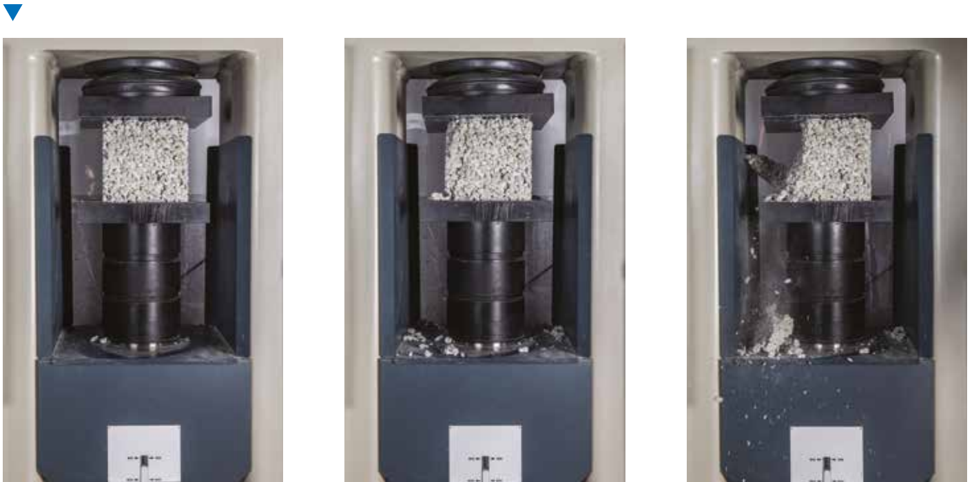
Compressive strength: failure phases of a cube of pervious concrete

The amount of mixing water required for pervious concrete is very important in order to achieve just the right consistency to place the concrete and finish off the surface, but it is not such an important factor as far as the development of its mechanical properties is concerned. In fact, other factors have a far greater impact on the mechanical properties of pervious concrete than its water/cement ratio. The D_{max} of the aggregates, the amount of cementitious paste, the void content and the way the voids are interconnected all play a very important role in achieving its mechanical properties. The compressive strength of pervious concrete, which is measured using the same methods as for conventional concrete, does not depend on its water/cement ratio, but rather on the level of compaction and the level of cohesion established between the particles. It must be noted, therefore, that the traditional methods adopted by current norms and standards to prepare samples should be reviewed in order for them to be applicable also to pervious concrete.