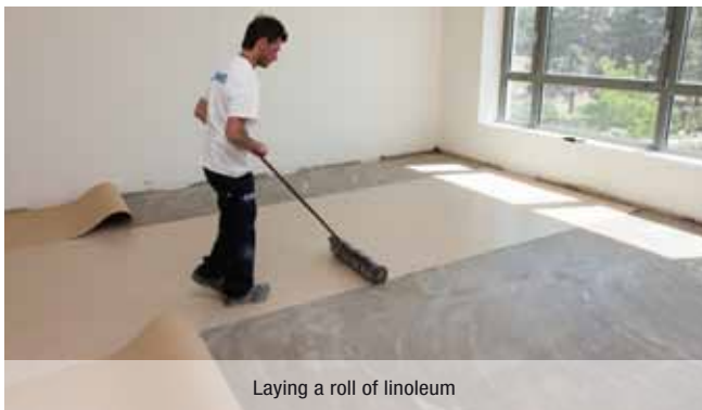
Laying a roll of linoleum