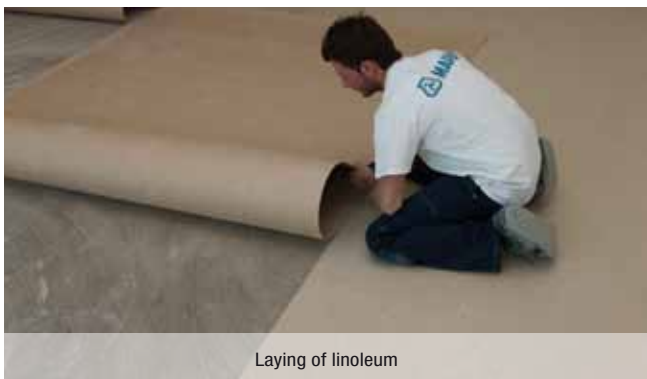
Laying of linoleum