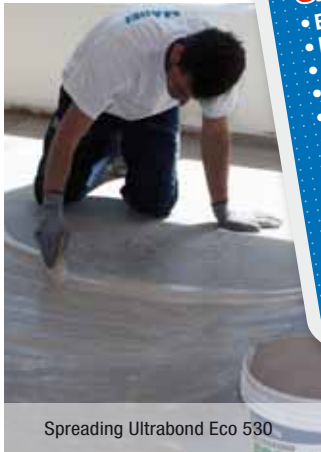
Spreading Ultrabond Eco 530