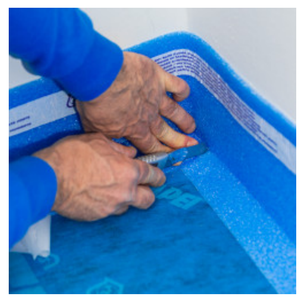
At the corners, cut the lower horizontal part of Mapesilent Band R where necessary