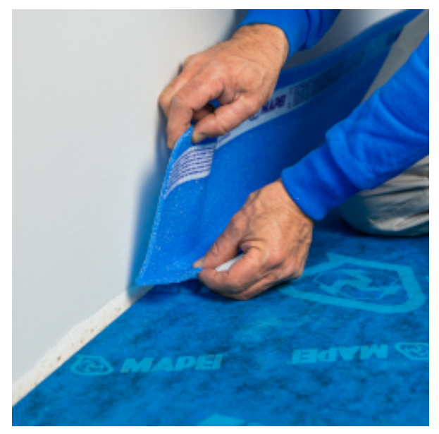
Apply Mapesilent Band R around the perimeter of the room, removing the protective film on the reverse side