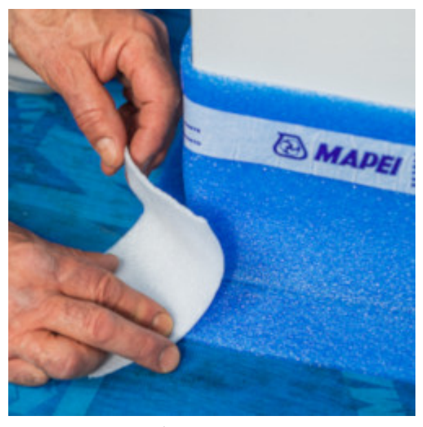
Cut and apply Mapesilent Tape in all the corners and along the overlaps of Mapesilent Band R and Mapesilent Roll around the blended-in areas of Mapesilent Band R to guarantee that the joints are perfectly protected