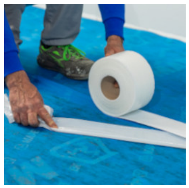
After checking that the sheets of Mapesilent Roll overlap perfectly, seal all overlaps using Mapesilent Tape