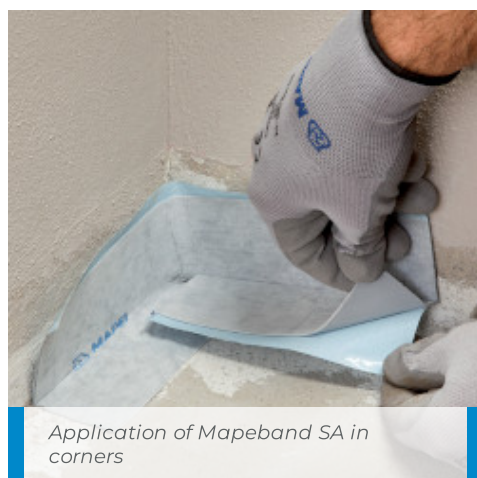
Application of Mapeband SA in corners