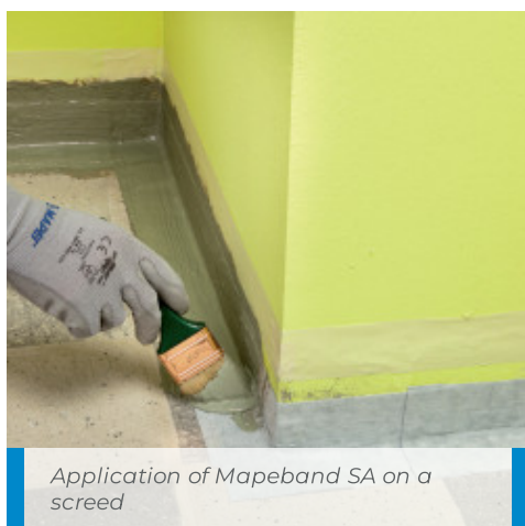
Application of Mapeband SA on a screed

To finish, waterproof the substrate with a product from the Mapelastic range, Mapegum WPS or Aquaflex Roof .