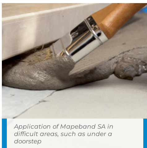
Application of Mapeband SA in difficult areas, such as under a doorstep