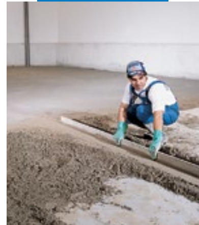
Preparing a levelling strip

The contents of this Technical Data Sheet ("TDS") may be copied into another