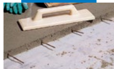
Detail of a Topcem screed with reinforcement rods