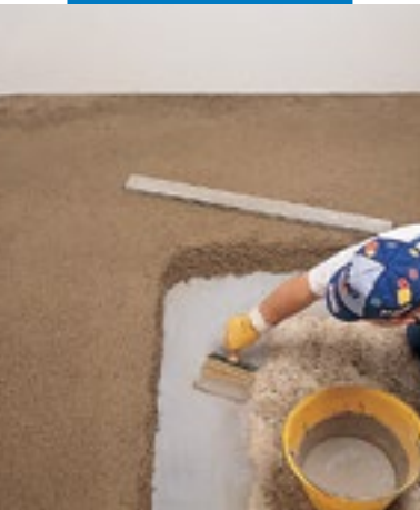
Spreading the anchoring slurry for bonded Topcem screeds