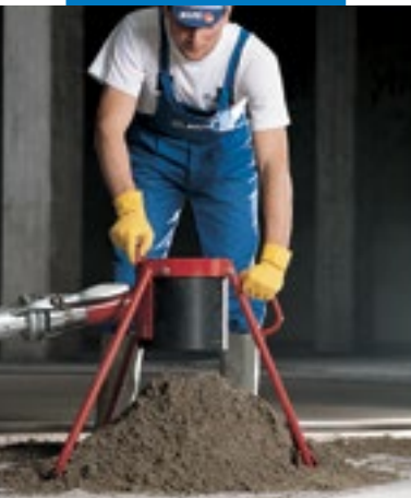
Batching a Topcem mix