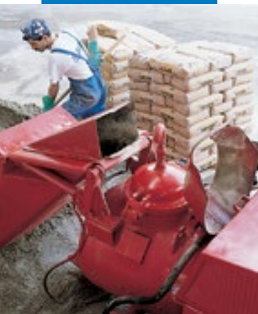
Mixing Topcem with an automatic pumping unit