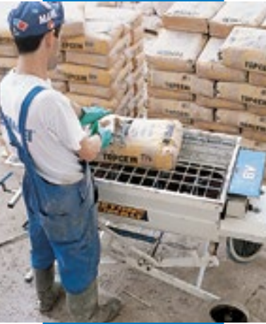
Mixing Topcem in a mini-batcher