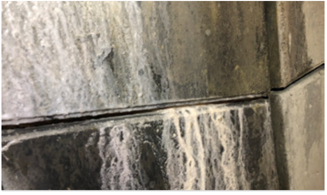
Example of segment joint partially clogged by CaCO<sub>3</sub> deposit