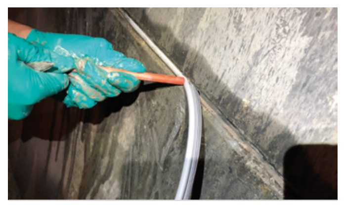
MAPEPLAN JOINT installation by using hand tool