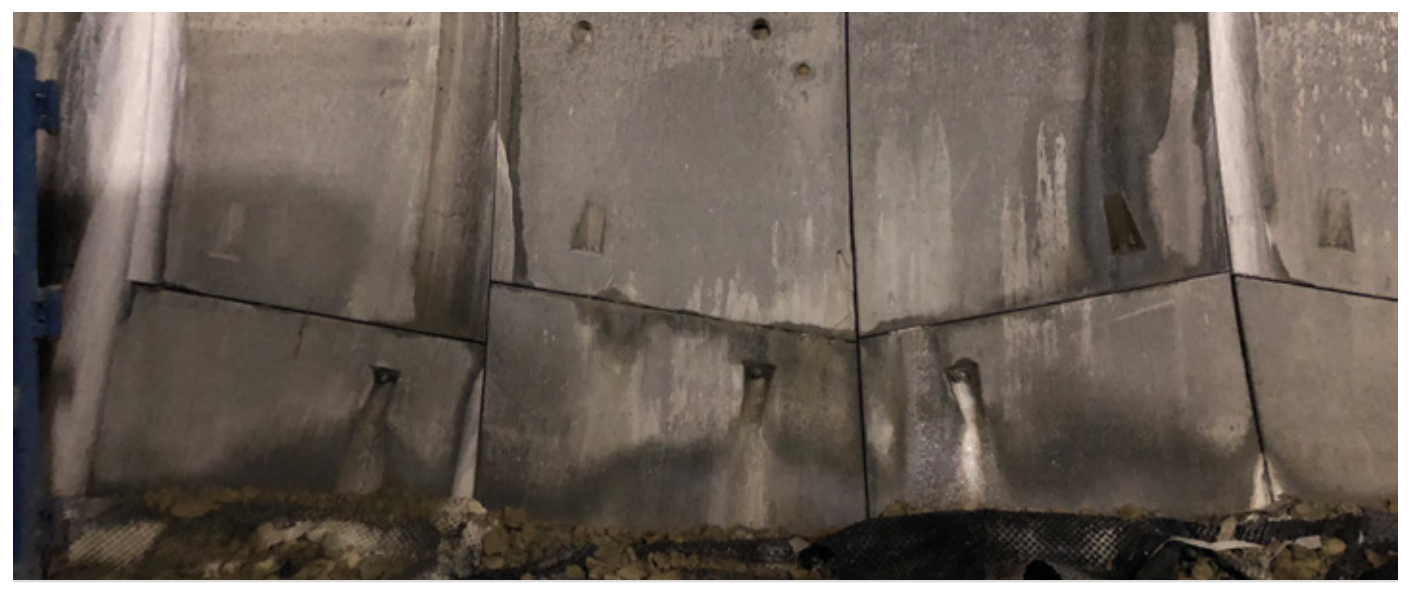
Surface inspection: address the segment jont that shall be sealed

Cleaning of the joint has to be carried out with hand tools and / or with high pressure water jets, starting from the top of the tunnel down to the invert.