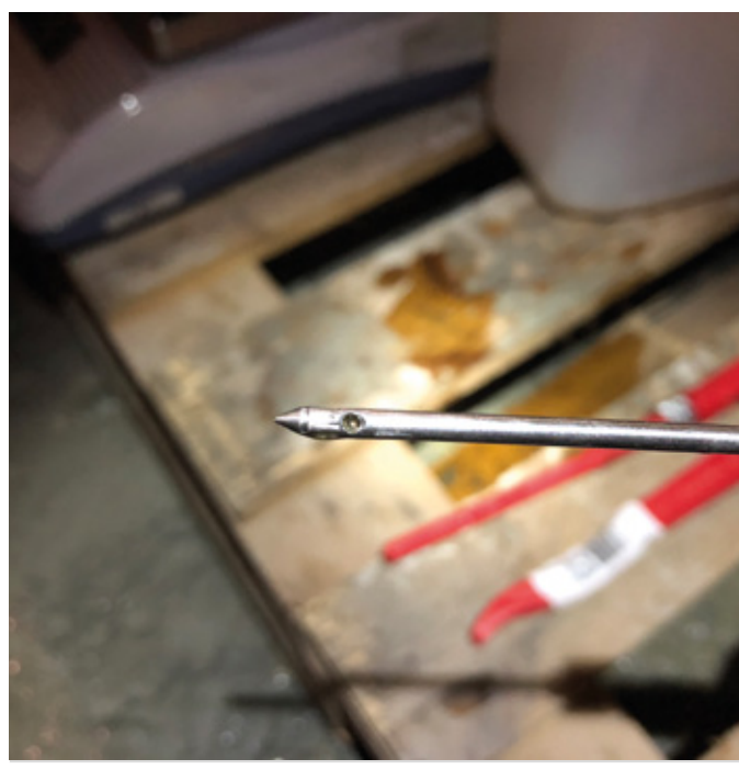
MAPEPLAN JOINT INJK