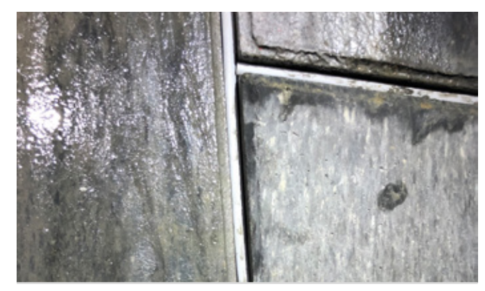
MAPEPLAN JOINT T Joint – junction between longitudinal and transversal joints