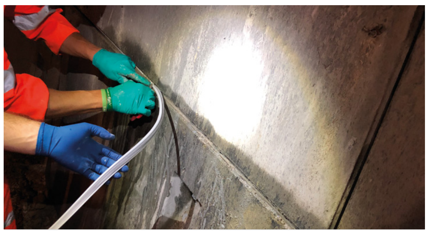
MAPEPLAN JOINT installation

Following the cleaning step, it is necessary to introduce MAPEPLAN JOINT in the joint, starting from the transversal joint and then to the longitudinal ones.