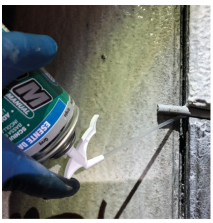
Head joint sealing by using MAPEPUR UNIVERSAL

RESFOAM IKM HS has to be prepared following the instructions in the technical data sheet. Once ready, the fluid has to be pumped to MAPEPLAN JOINT INJK, injection needle selected to be able to be easily installed across the joint and reused several times.