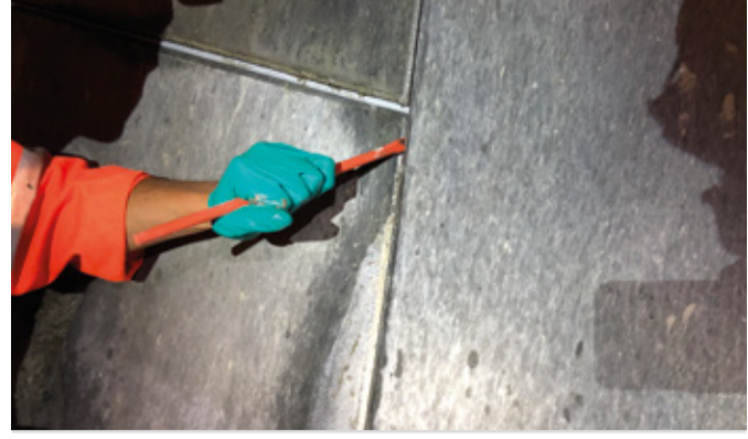
Surface joint cleaning