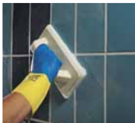
Cleaning with water and a disk cleaner fitted with a "Scotch Brite®" type abrasive disk