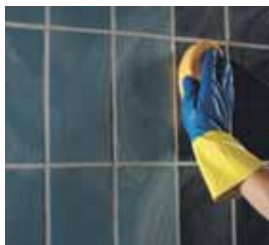
Removing liquid residues with a rubber spreader