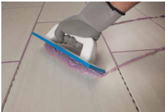
Applying Kerapoxy CQ with a Mapei trowel