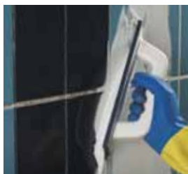
Applying Kerapoxy CQ with a Mapei trowel on walls