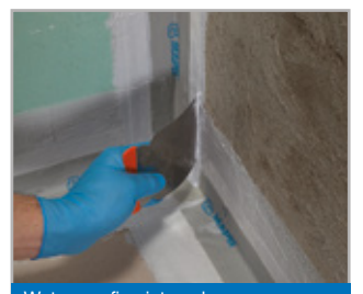
Waterproofing internal corners correctly by applying Mapeband PE120 and specially shaped pieces