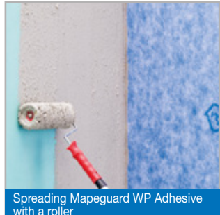
Spreading Mapeguard WP Adhesive with a roller