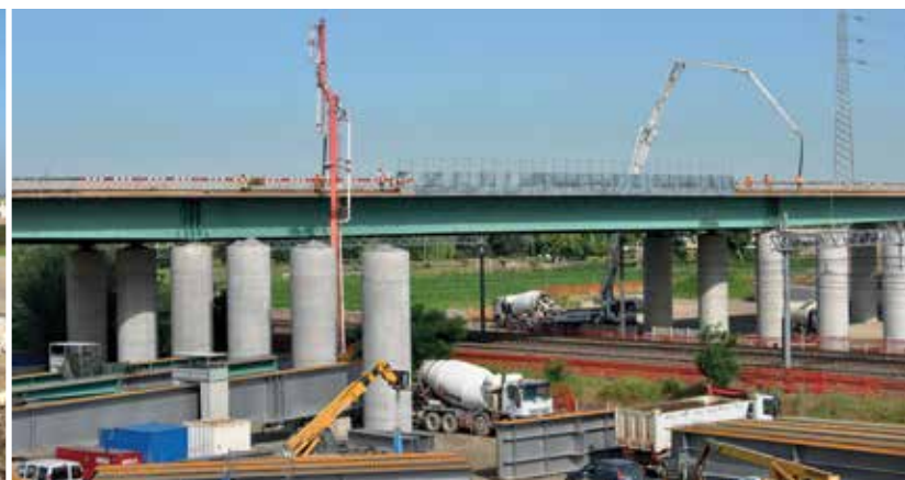
slab on viaduct