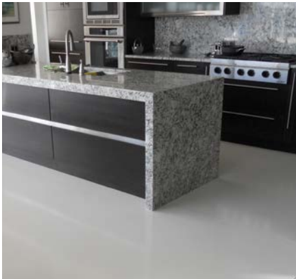
GLOSS Mapecfloor Finish 53 W/L