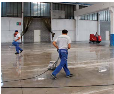
High Performance Finish – Mapecrete Hard LI

Mapecfloor Finish 630 is a two-component, protective, acrylic filming agent in water dispersion for floors made from concrete and Ultratop systems. It provides good UV resistance and a high-performance finish.