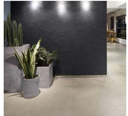
MATTE Mapecfloor Finish 58 W