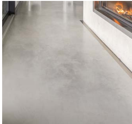
SEMI-GLOSS Mapecfloor Finish 54 W/S