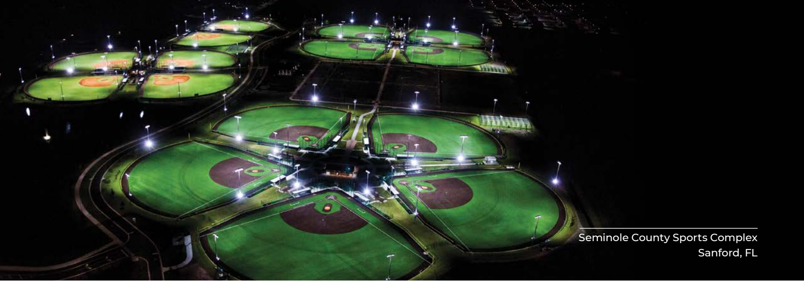
Seminole County Sports Complex Sanford, FL