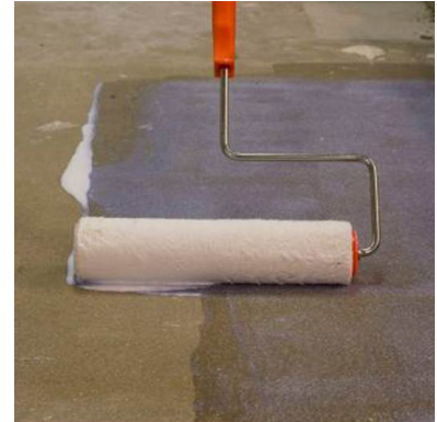
Always read the data sheet for each product to determine thickness or coats required.

Some primers are for porous surfaces, others are for nonporous surfaces, and a few can handle both types. A more tenacious bond, such as an epoxy with sand broadcast into it, may be needed for applications subject to frequent, heavy dynamic loading. In the case of a lightweight gypsum substrate, the primer must be diluted and at the right dilution rate. Applying the primer properly to the floor will not only help to ensure proper bonding of the underlayment, it will allow the primer to cure properly or to dwell on the floor for an adequate amount of time without exceeding open times, all of which become important factors in properly installing the primer.