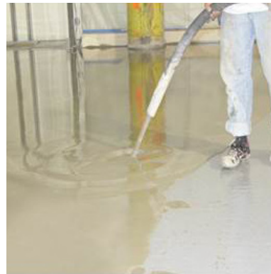
More and more contractors are making SLUs a standard for substrate preparation.

Before SLU installation, close all doors and windows and turn off HVAC systems to prevent drafts during application and until the self-leveling underlayment has properly cured. Protect the application area from direct sunlight until cured. Drafts and direct sunlight can cause the SLU to dry rapidly and can create performance issues caused by inconsistent drying of the underlayment. Thicker areas can also dry faster due to the exothermic heat generated during the hydration of the cement, possibly causing cracking in these areas and subsequent delamination of the underlayment.