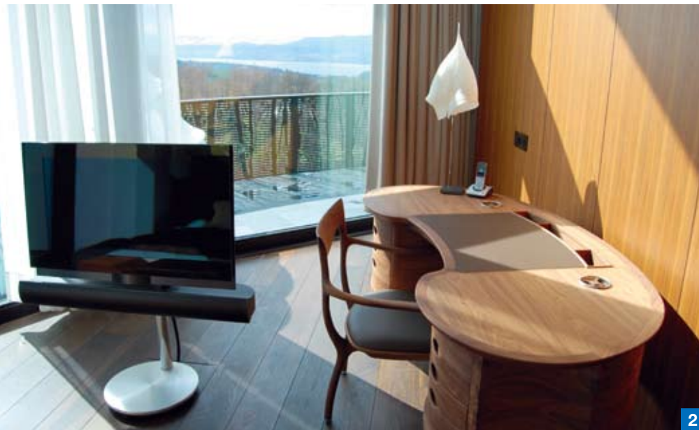
Photo 1. Outside view of The Dolder Grand in Zürich after completion of the restoration works.