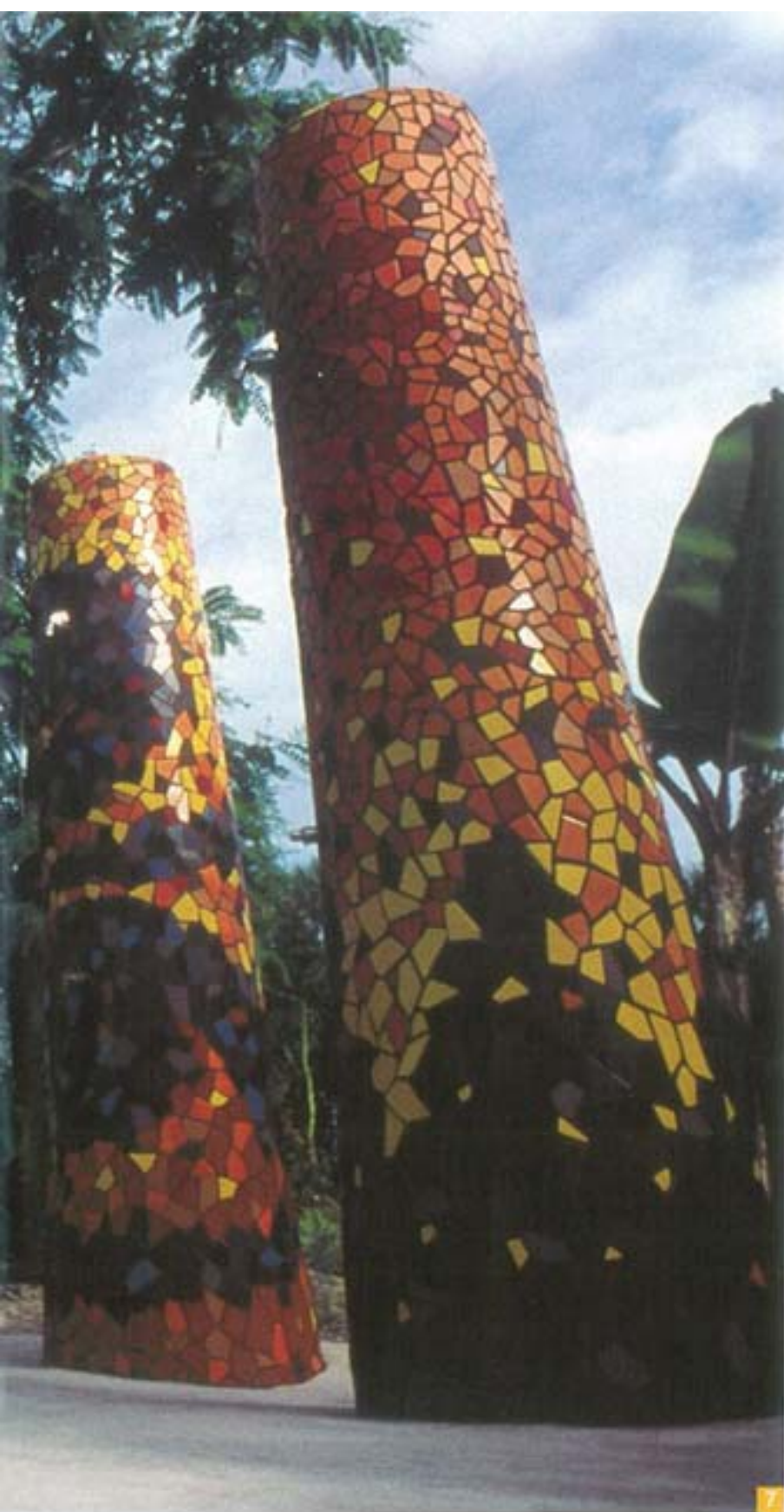
Photo 7. And after the "dive in paradise... with the dolphins", 14 giant columns that emerge like majestic pillars in various tones of red allow the fortunate swimmers to wash themselves up: in fact, they are 14 giant showers.

epoxy sealant that was previously planned by the specifications. All Mapei products, the adhesive KER 121* as well as the grouts KER 200* and KER 700*, were supplied by Summitville Orlando Inc. In spite of the dimensions and complexity of the project, the KER 200* sealing grout worked perfectly, as confirmed by Ralph Young, who added: "I filled in spaces of different widths and thicknesses, from 1/8" to 11/2", with no