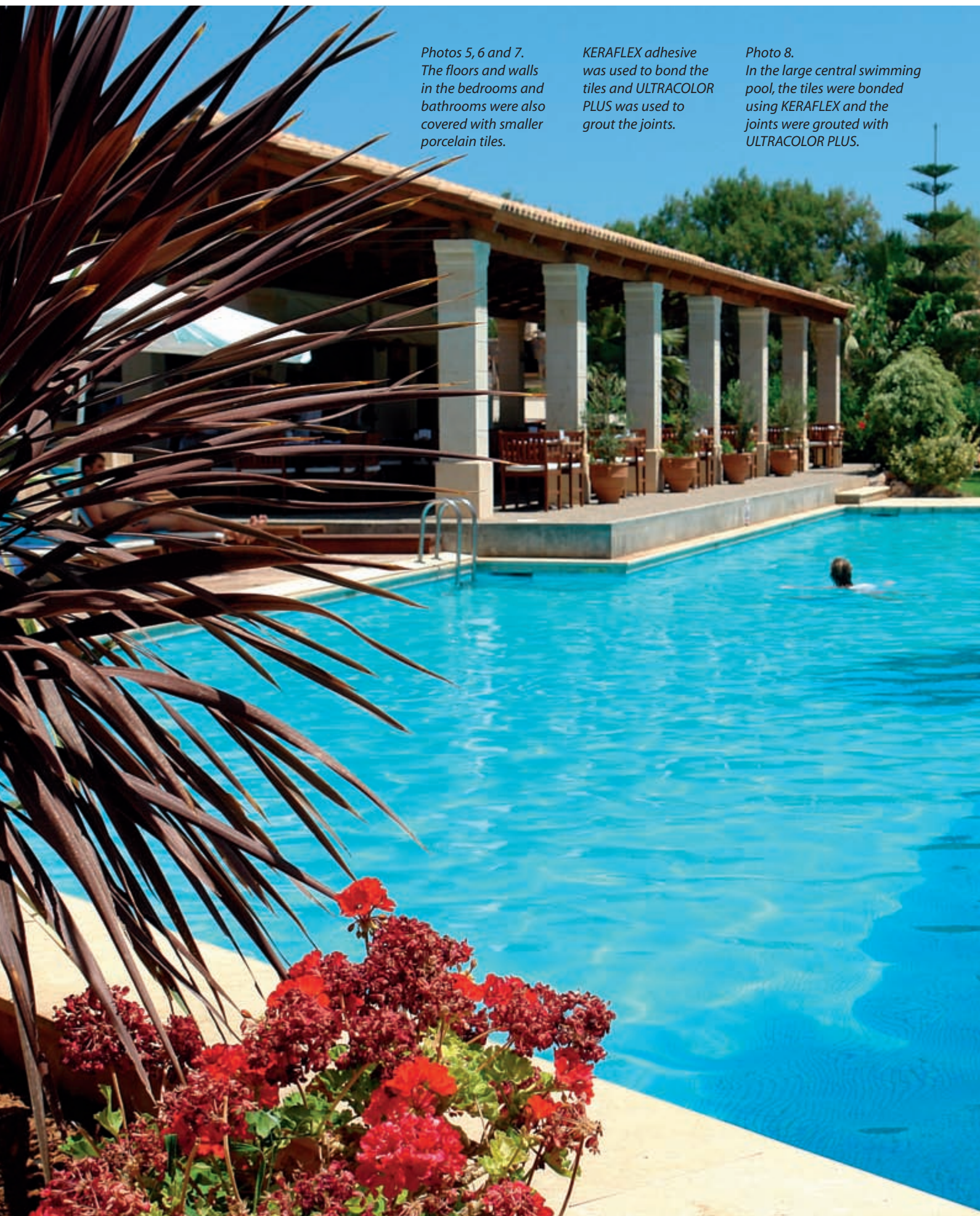
Photo 8. In the large central swimming pool, the tiles were bonded using KERAFLEX and the joints were grouted with ULTRACOLOR PLUS.

KERAFLEX adhesive was used to bond the tiles and ULTRACOLOR PLUS was used to grout the joints.