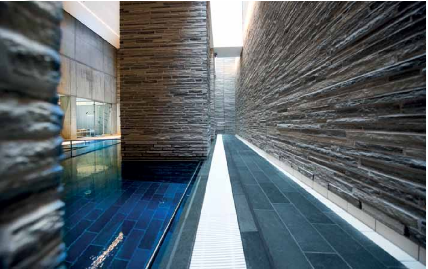
ABOVE. The grout lines were filled with KERACOLOR GG and the joints were sealed with MAPESIL LM and MAPESIL AC.

ECO R rapid self-levelling mortar to form substrates from 3 to 20 mm thick, CONFIX spray-applied mortar to repair the concrete and MAPEPOXY L epoxy adhesive to repair the cracks. These products are all made and sold in Norway by Mapei AS. The concrete surfaces were restored with MAPEGROUT T40 thixotropic mortar. Where required, surfaces were waterproofed with MAPELASTIC two-component cementitious mortar, which is particularly suitable for creating highly flexible, protective waterproof coatings on structures subject to cracking. To install the slabs of ardesia, Mapei Technical Services recommended ULTRALITE S1 one-component, high performance adhesive, while ULTRALITE S2 lightweight cementitious adhesive was the preferred choice for the large format slabs. The product chosen to fill the grout lines was KERACOLOR GG high-performance, polymer-modified cementitious mortar for grout lines from 4 to 15 mm wide. The expansion joints were sealed with MAPESIL LM and MAPESIL AC.